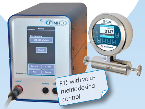
R15 with volumetric dosing control

Integrated dosing controller with adapted control algorithms for communication with a balance or a flow sensor. A separate dosing regulator is not required