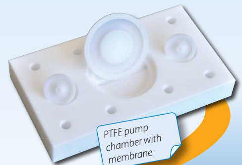
PTFE pump chamber with membrane