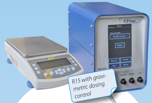
R15 with gravimetric dosing control

***** when using a thermally decoupled pump head