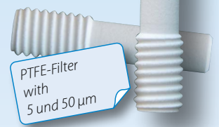
PTFE-Filter with 5 und 50 µm

○ Special design according to customer requirements